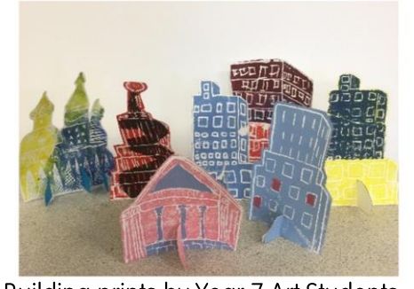
Building prints by Year 7 Art Students