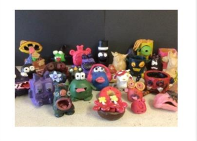
Monster Pots from Year 9 Art Class