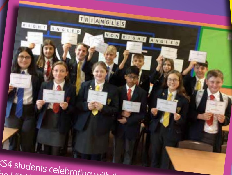
KS4 students celebrating with their certificates from the UK Maths Challenge. Well done to all!