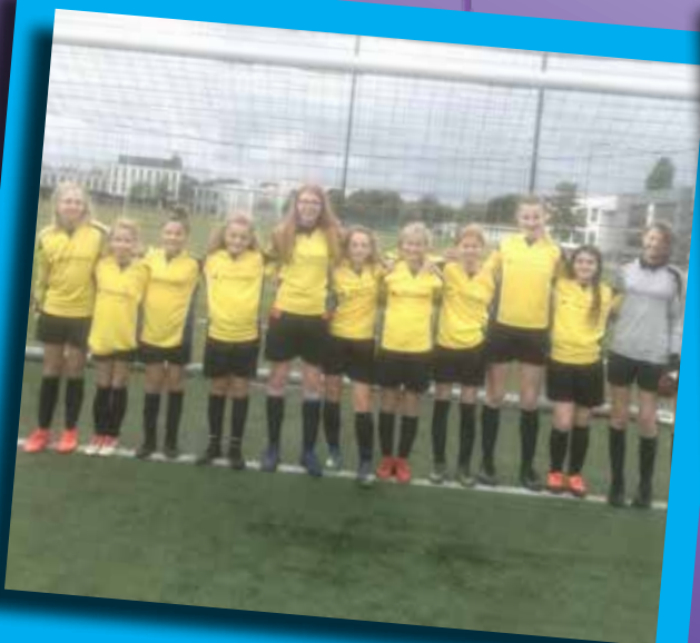
U14 Girls football team have made it into round 3 of the National Cup and are currently top of the Dudley 9-a-side league.