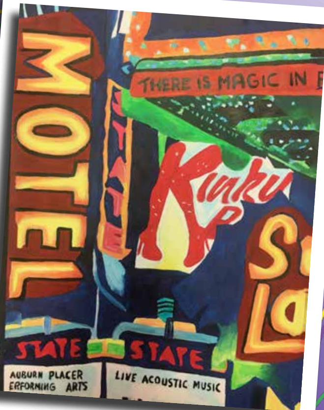
GCSE art work from Larissa Burke