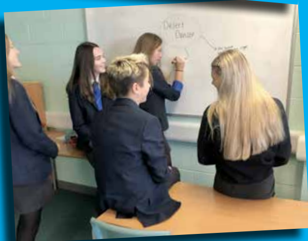
GCSE Dance students have been deep in thought discussing lighting in performance pieces.