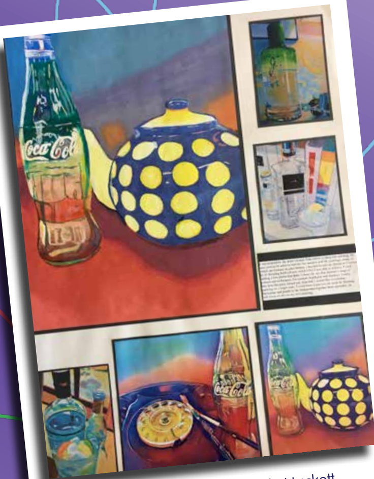
GCSE art work from Isabelle Hackett