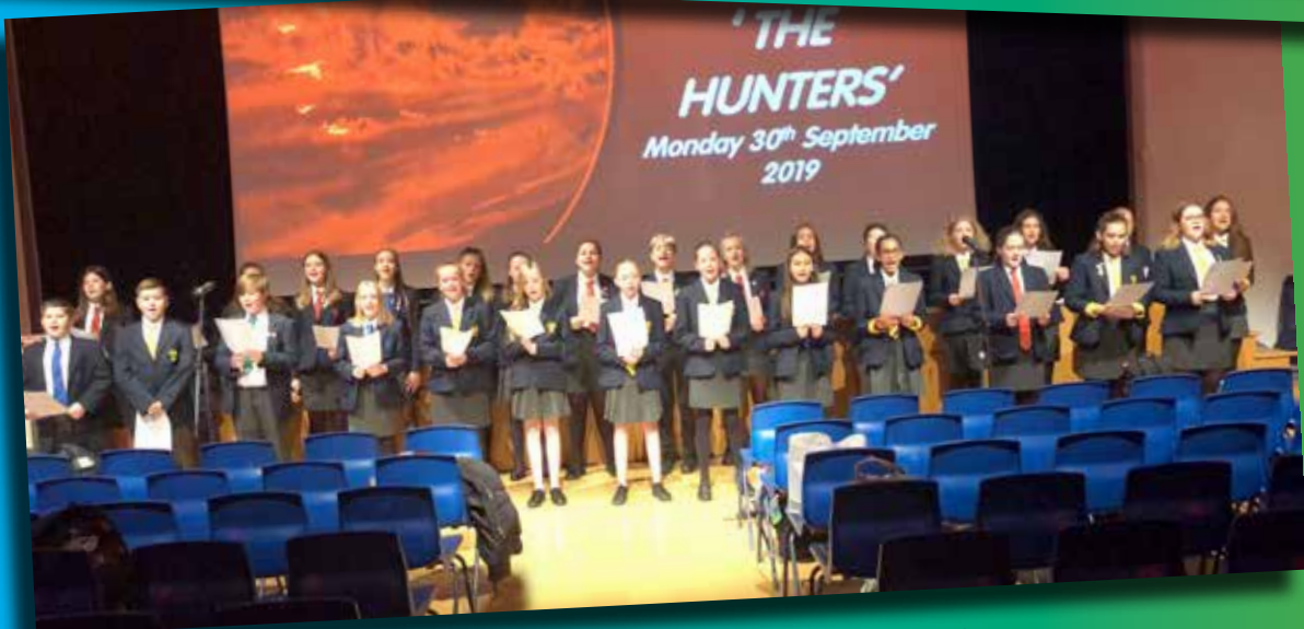
A great turn out for Choir to start the year!

Black History Month has been officially celebrated in the UK since 1987.