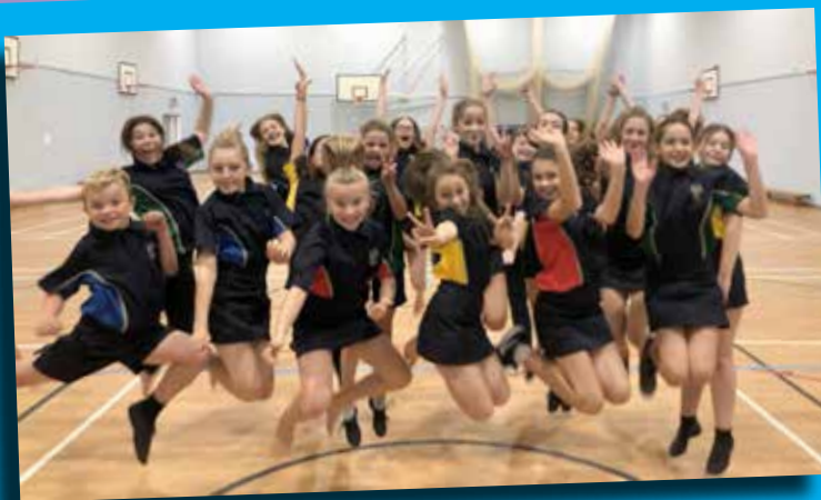
Amplify Dancers have had a brilliant start to the year and are excited to be working on new pieces of choreography for the Christmas Cracker.