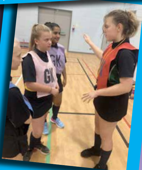
KS3 Netballers have been sharing in each other's knowledge at training.